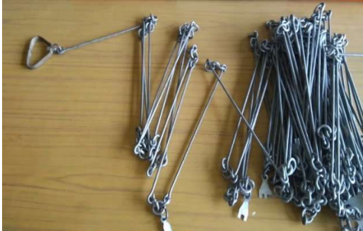
Img. 1: Chain