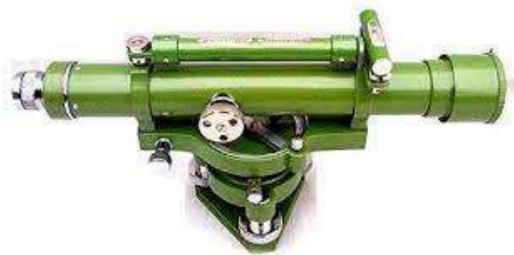
Img. 3: Dumpy Level