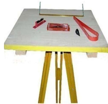
Img. 2: Plane Table